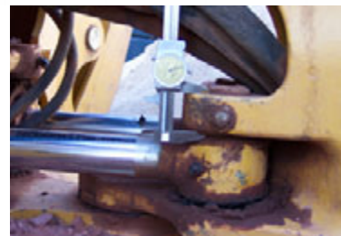
3.2 Lug Ear Thickness