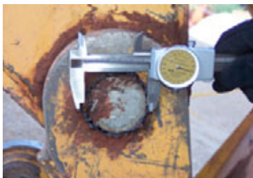
3.0 Original Pin Diameter