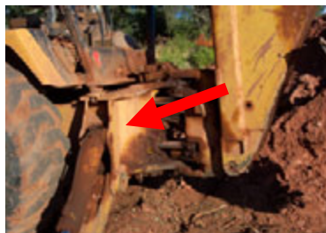
3.5 Moving / Stationary Obstacle