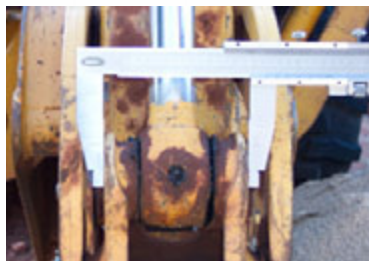
3.1 Total Length