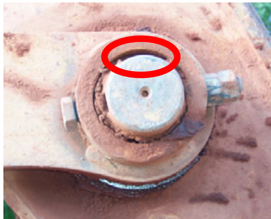
6.0 Fill out information