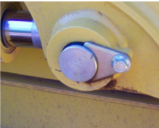
6.0 N/A (Thickness included in 3.2)