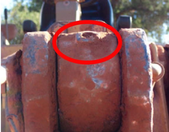
5.0 (A) Grease from outside