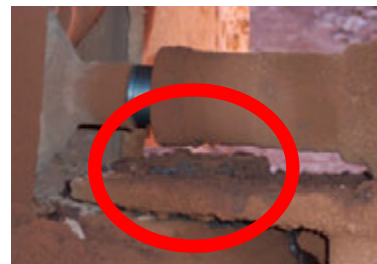
3.5 Moving / Stationary Obstacle