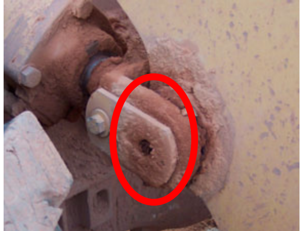
5.0 (B) Grease through pivot pin